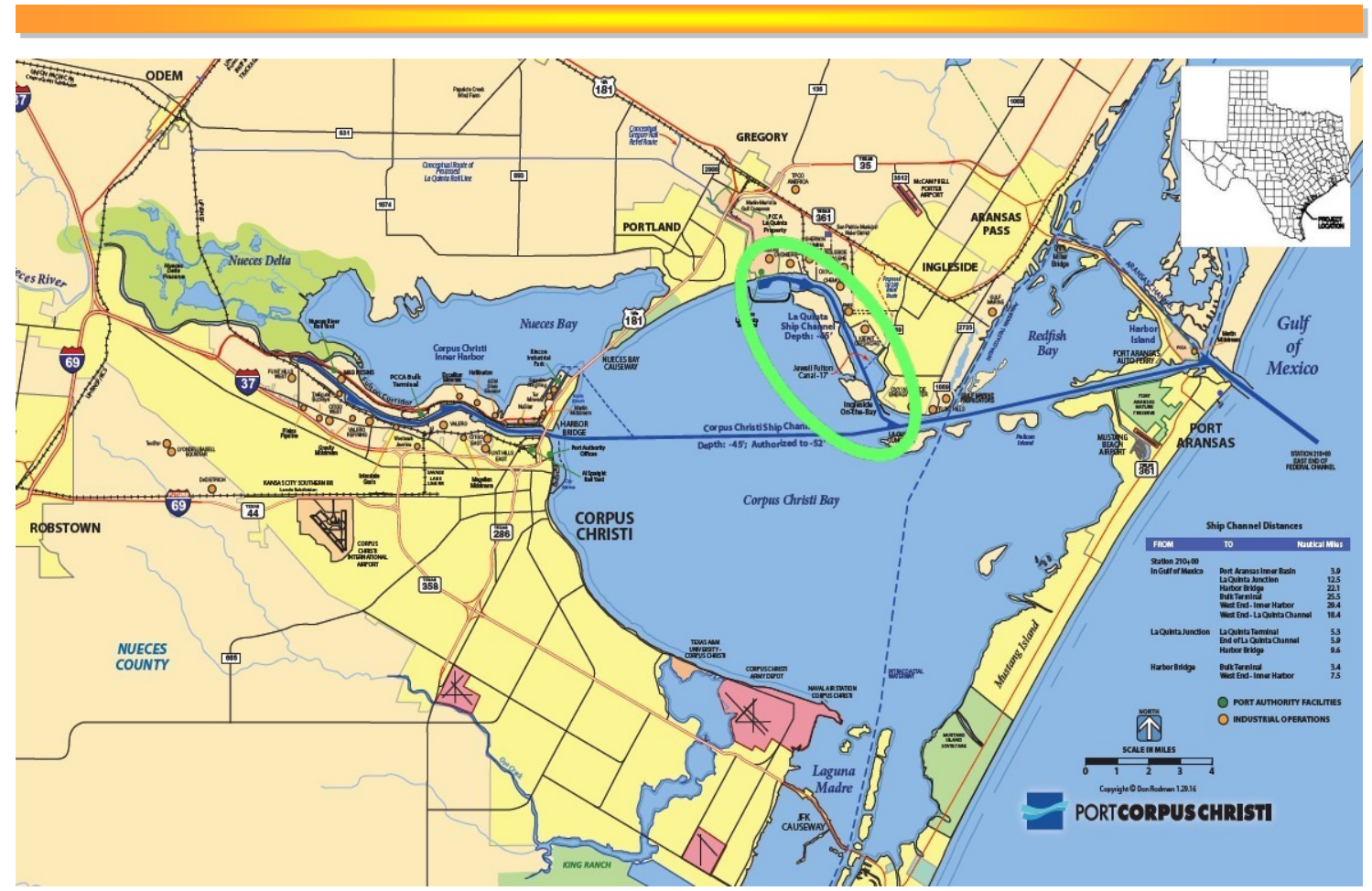
La Quinta Section 1201 (23) of WRDA 2016